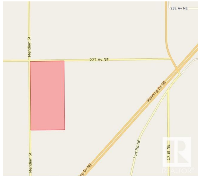
Edmonton Energy and Technology Park